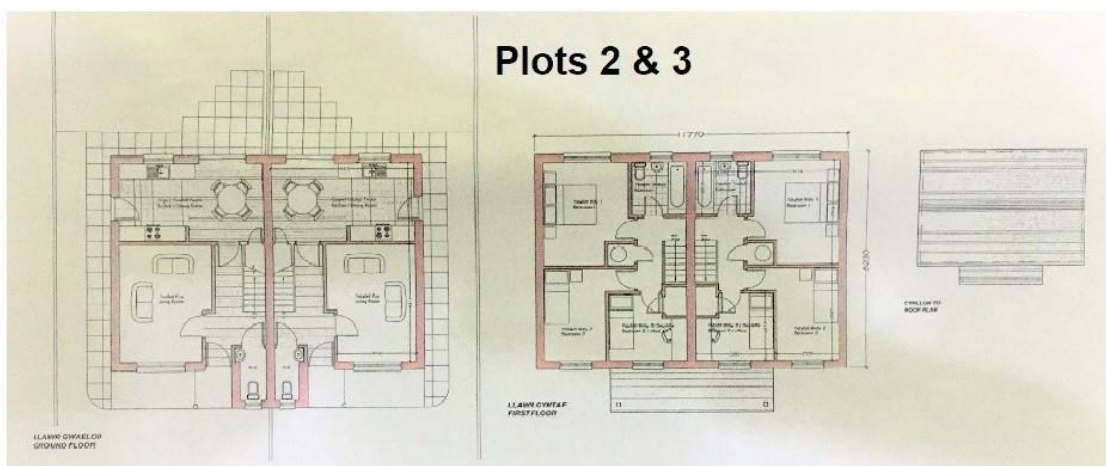
Plots 2 & 3